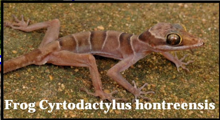
Frog Cyrtodactylus hontreensis