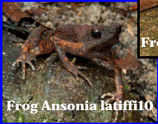
Frog Ansonia latiffi 10